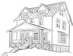
Dr. Bob's Home AKRON, OHIO